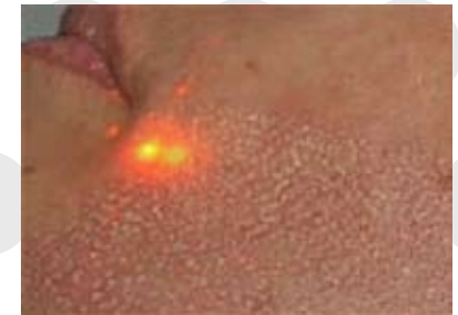
A high-energy laser beam is applied in a fractional pattern over the surface of the treatment area, leaving areas of untouched skin to promote quicker healing.

"bridges" of untouched skin promote healing